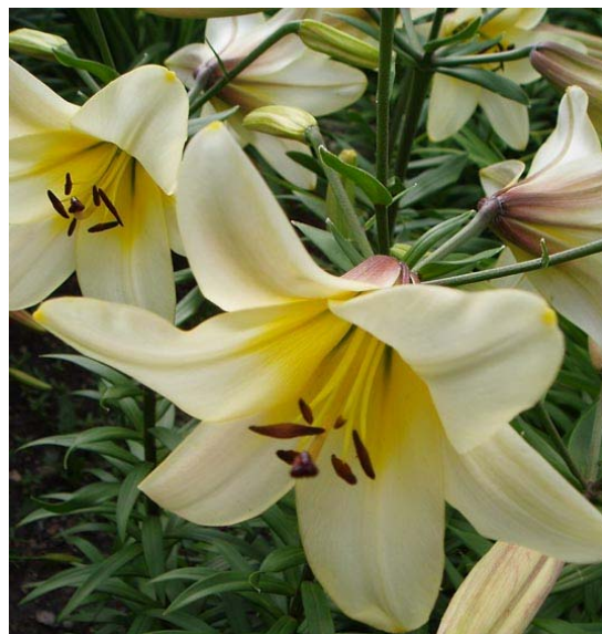
Asiatic ‘Creamy Bells’ in Brandon University Display Garden