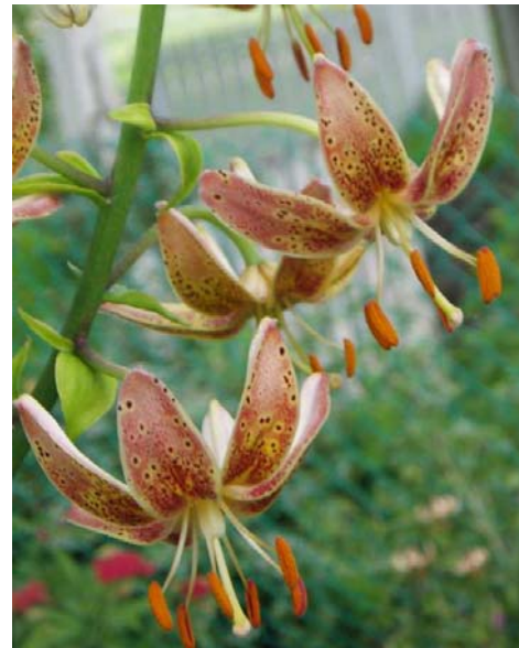
An unknown martagon in the editor's garden.. Perhaps it will be identified at the martagon show! (BJ)